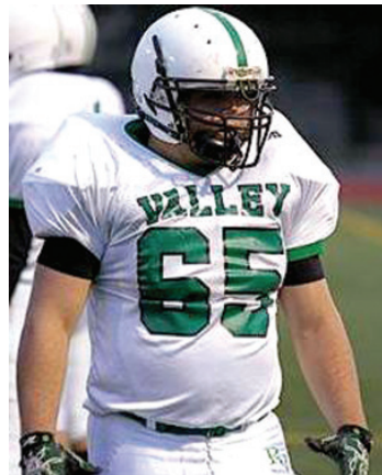
1ST TEAM ALL-LEAGUE