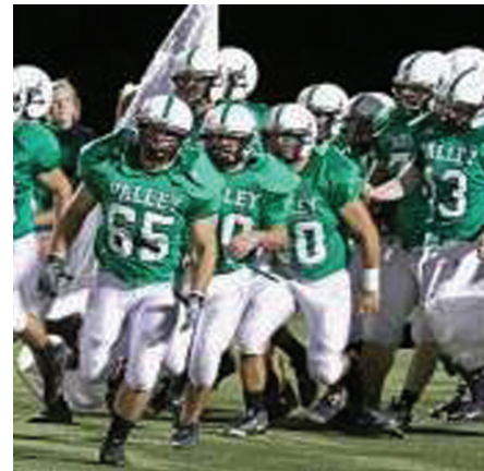
P.V. DLINE MVP - 2010

...SEAN Believed in OUR Training, and WE BELIEVE IN SEAN!