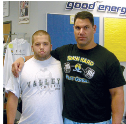
Member - 1,000 LB$ CLUB