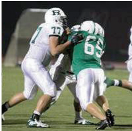
LEADER ON THE FIELD!