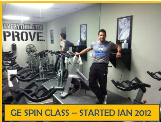
GE SPIN CLASS – STARTED JAN 2012