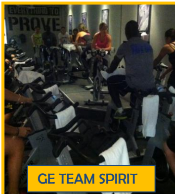
GE TEAM SPIRIT