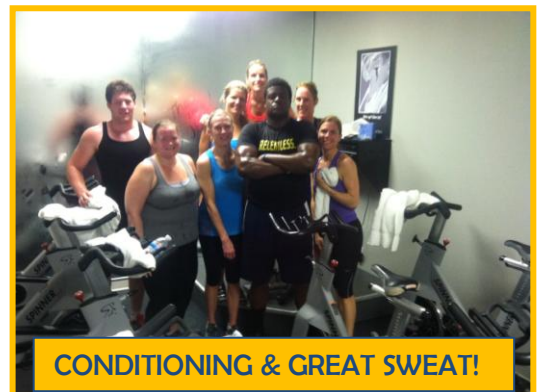
CONDITIONING & GREAT SWEAT!